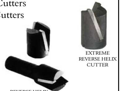
EXTREME REVERSE HELIX CUTTER