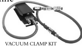
VACUUM CLAMP KIT