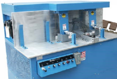
DENTIL MOLDING MACHINE

HER-SAF ROUTER BITS ARE AVAILABLE IN A WIDE VARIETY OF SIZES.