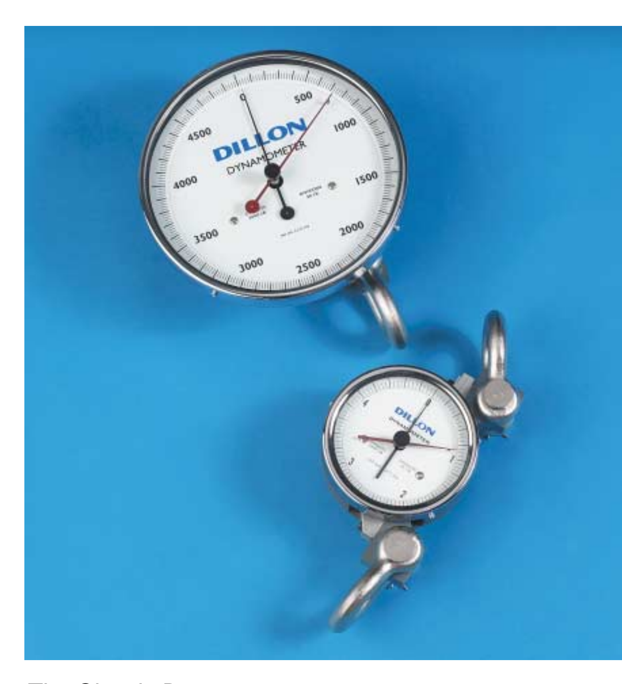
The Classic Dynamometer