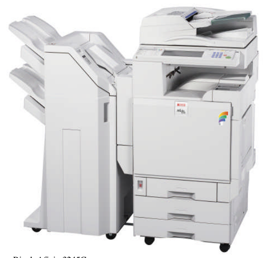
Ricoh Aficio 3245C

When there's a need to recreate or reproduce color, multifunction color copier systems will meet your requirements and deliver dependable output for any general office, or professional environment.