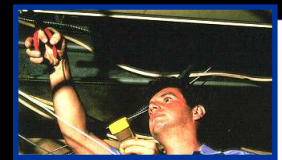
electrical & plumbing