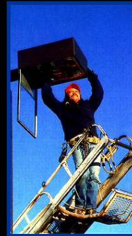
parking lot maintenance