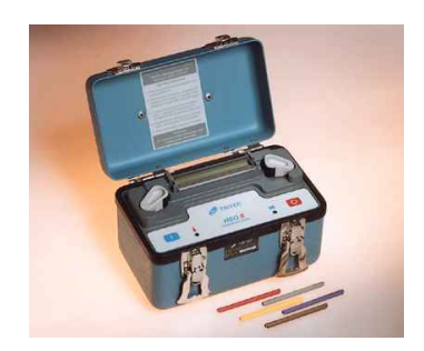
A technical data sheet for the HSO II Heatshrink Oven is available on request