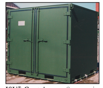
ISU® Containers - Secure, airtransportable storage for spare parts, weapons, perishable goods, and bare base equipment.

Today More Than Ever, Mobility is the Key...What can we build for you?