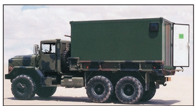
Mobility Shop Containers/Shop Vans for MTV, LMTV, MTVR, and M105 Trailer