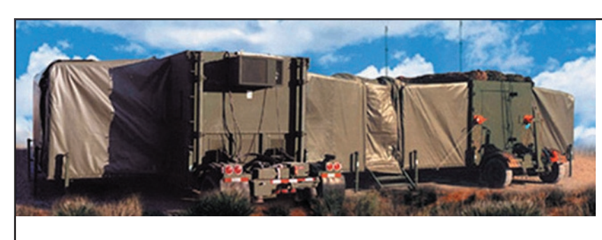
Lightweight Mobile Shelters are Air-, Helo-, Rail-, & Truck-transportable or detachable wheel sets can be used for transport as shown on the Tactical Operations Center complex above.