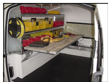
Cargobody w/Work Bench in Short Body

It can be loaded as required by the operator then mounted onto a regular pickup truck within minutes. Because of this new diversity, Cargobody is a better investment.