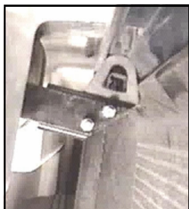
Lock System engages under box side rail

Because the Cargobody can be quickly and easily installed by just one person you have the ability to gain greater utilization of fleet vehicles. At the same time you will not compromise your needs, thus making the Cargobody an outstanding unique asset. Factory ready for quick and easy installment through its patented features makes the Cargobody unique.