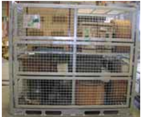
ISO Container Pallet loaded with electrical equipment