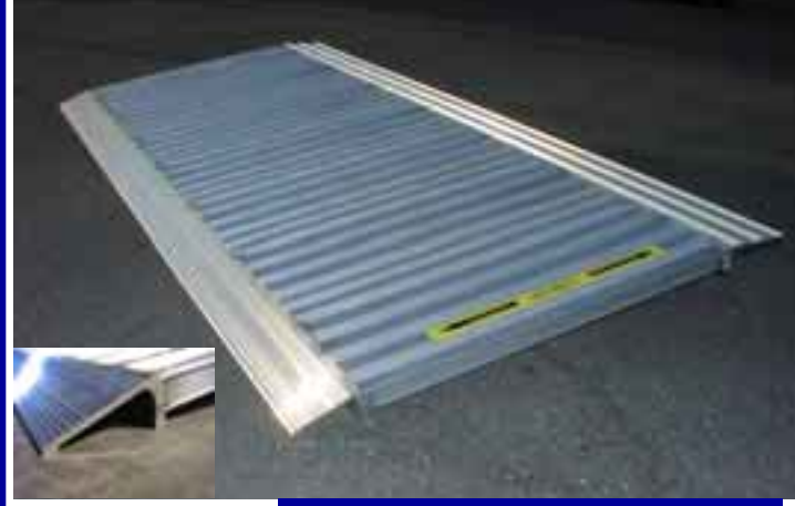
Features at a Glance