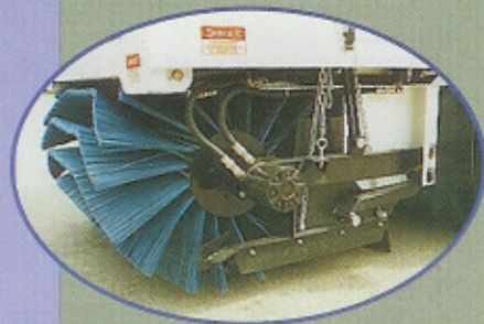
Revolutionary "Eliminator" Main Broom. Pick up more debris. Cover more ground.