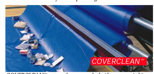
COVERCLEAN™ sweeps the cover on both sides as you wind it up.