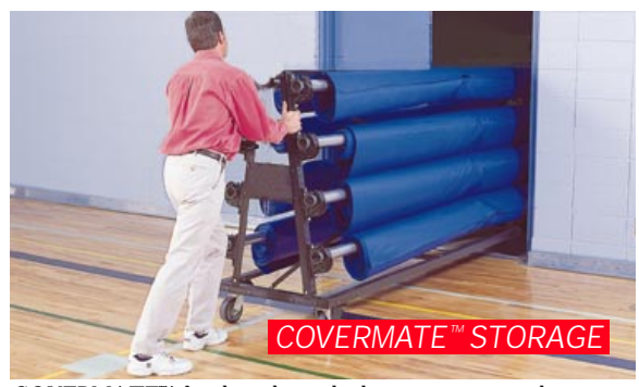
COVERMATE™ fits through standard size storage room doors.

COVERMASTER INC. 100 WESTMORE DRIVE, # 11-D REXDALE, ON M9V 5C3 TEL (416) 745-1811