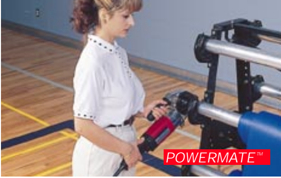
POWERMATE™ easily winds up the longest of covers sections.

COVERMATE™ VIDEO and GYM FLOOR COVER BUYER'S HANDBOOK