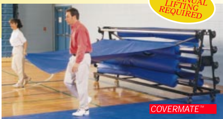
COVERMATE™ lets two people install a standard size cover in 30 minutes or less.