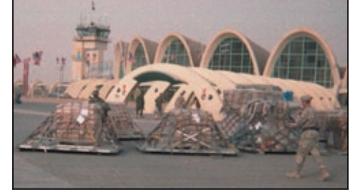
HCU-6/E 463L Cargo Pallets at work supporting our troops in Afghanistan

AAR MOBILITY SYSTEMS 201 Haynes Street, Cadillac, MI 49601 800-355-2015 * milsales@aarcorp.com * 231-779-4804 fax http://www.aarcorp.com/manufact/mobility.html