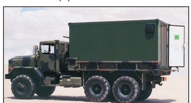
Mobility Shop Containers/Shop Vans for MTV, LMTV, MTVR, and M105 Trailer

Lightweight Mobile Shelters are Air-, Helo-, Rail-, & Truck-transportable or detachable wheel sets can be used for transport as shown on the Tactical Operations Center complex above.