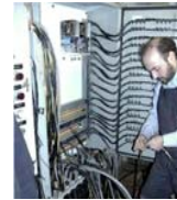
Technician working on motor control panel.

We at Servelec can design and build to specifications any size of panel from push button control station to the largest multi-door motor control panel.