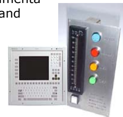
Bilge Level Alarm & Control