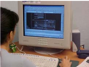
Auto Cad Drawing