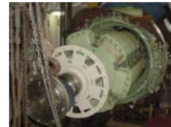
Removing old Rotor

Servelec's motor / generator shop provides motor rewinding and restoration as well as generator and regulator repair and service.