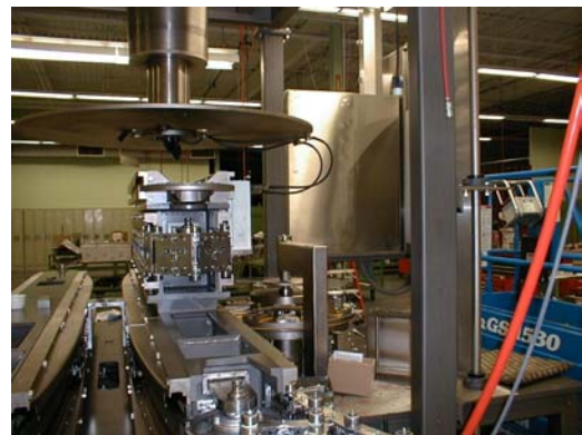
Custom Food Processing Conveyor Assembly with Rotating Electrical Turntable.