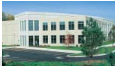
The new Star-SU main office in Hoffman Estates/Illinois, 30 minutes from Chicago O'Hare.

Star-SU Inc. 5200 Prairie Stone Parkway, Suite 100 Hoffman Estates, IL 60192 USA Tel.: (847) 649 1450 Fax: (847) 649 0112 sales@star-su.com