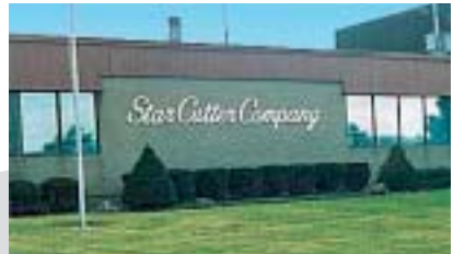
The Star-SU Service Center in Farmington Hills, MI.

Star-SU Inc. 23461 Industrial Park Drive Farmington Hills, MI 48335-2855 USA Tel.: (847) 649 1450 Fax: (847) 649 0112 sales@star-su.com