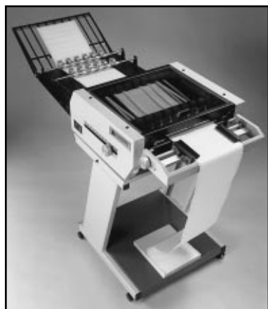
Shown is a Model 297 burster with stand, traction feed and conveyor stacker options.

GSA NET PRICE MODEL PART NUMBER ITEM NUMBER