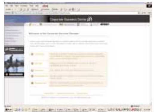
Web-based management allows you to log on securely from anywhere for complete control of your account and data.