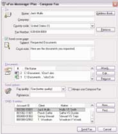
eFax Messenger Plus puts names, fax numbers, document selection, client matter codes, and more at your fingertips.