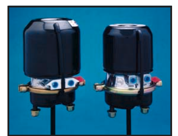
Newest Magnum "Performance" Plus Piston-Type Spring Brake.

We continue to refine our products and develop new solutions for our customers' changing needs. MGM Brakes offers a full model line including both double-diaphragm and piston-type spring brakes for use with wedge, Sand Z-cam, and disc foundation brakes. MGM Brakes once again leads the industry with our innovative 3-inch "Long Stroke" spring brakes and latest pistontype models.