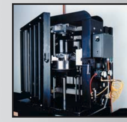
Assembly Fixture for analyzing Tamper Resistant Brakes.