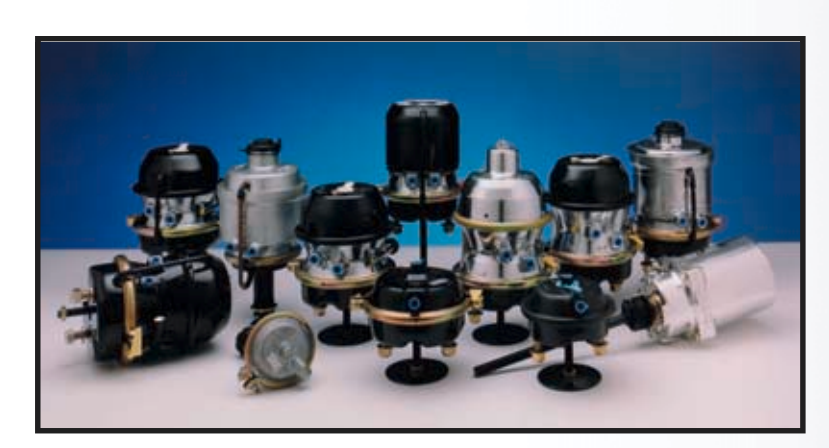
MGM Brakes offers a full model line including both double diaphragm and piston-type spring brakes.

The MGM Brake was soon combined with the service brake to form a single component—a Spring Brake. As the inventor and manufacturer of the industry's first truly effective safety device, MGM Brakes rapidly progressed from its humble origins to industry-leader status. Today, our spring brakes are standard equipment on more than 125 makes of commercial vehicles manufactured in over 40 countries.