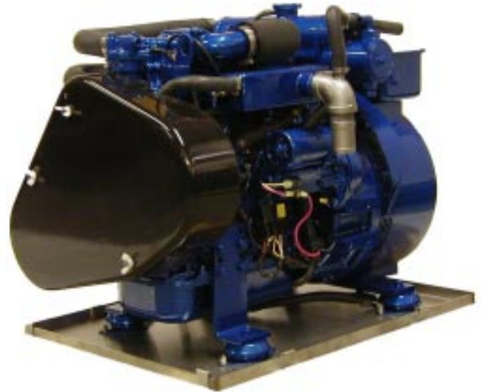
Pictured is the model 600 Navigator Series (Some options may be shown)

Type..3 cyl.,.....4 cycle, water cooled, OHV Fuel System.....indirect injected Bore & Stroke.....3.05" x 3.14" Piston Displacement.....68.6 cu. in. Compression Ratio.....22:1 Coolant Capacity (Block).....2.3 qts. Lube Oil Capacity.....4.8 qts. dB(A) @ 7 meter w/o intake & exhaust attenuated.....75 dB(A) @ 7 meter w/sound shield & muffler.....55 Fuel Consumption at full load.....1GPH Warranty.....5 year 5000 hour